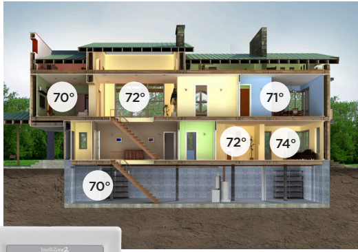
Individual thermostats or zone sensors provide flexibility in temperature management. Control temperatures from the master stat or from separate zone stats.